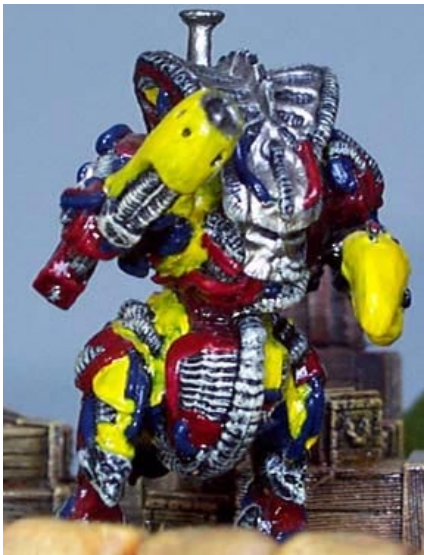
A Small Sized Walker

All that to come up with a base figure cost of 28 per model. If you are like most people, the majority of your army is made up of similar models (i.e., most of your models wear power armor). This is the cost of all the models you are going to put on the table with these statistics. You will have to track the number of models in your army on a separate sheet of paper. For now just list the cost of each model in the appropriate box on the Unit Sheet.