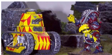
Small Tank and Walker