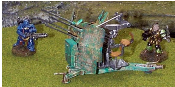
Platform Weapon with a crew of two

Full or high Level Flight means that the flying unit can fly anywhere and is generally considered outside the battle zone when not over a target. When used, the unit must come onto the table from the owning players side and must trace a straight line path to the target unit, drop its payload or fire its weapons and then continue straight ahead off the edge of the table. While over the target, Anti aircraft weapons on Overwatch (which is how you want to keep them) fire at incoming high-level flyers before the aircraft can drop their bomb load. Once the bombs have been dropped, the aircraft continue straight ahead to exit the table.