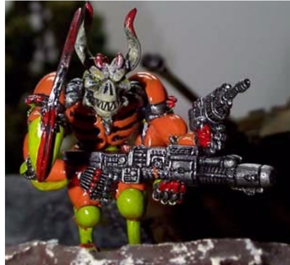
This is a large two-legged (walker), called an Assault Fiend. I would say that it has the equivalent to Medium (Vehicle) armor giving it a target type of 5Med.

These rules are here to avoid problems in the game, although the single easiest way to avoid problems is for you and your opponent to work out your units together, at least for the first game or two. Once you both see how it works, and get a feel for how the other thinks, you can then go off and design separate armies.