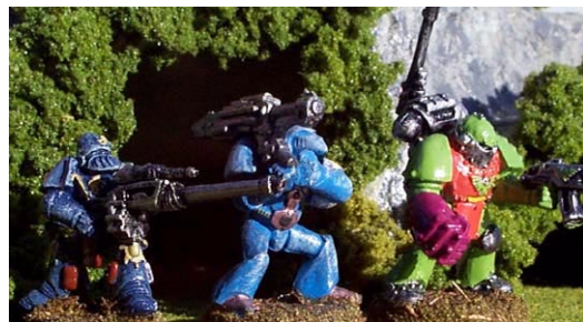
The image above shows three space marines in power armor