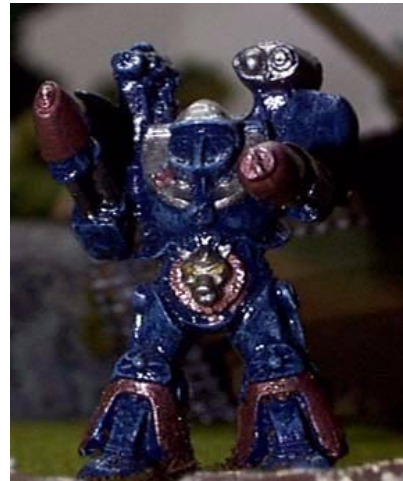
Infantry in Assault Armor