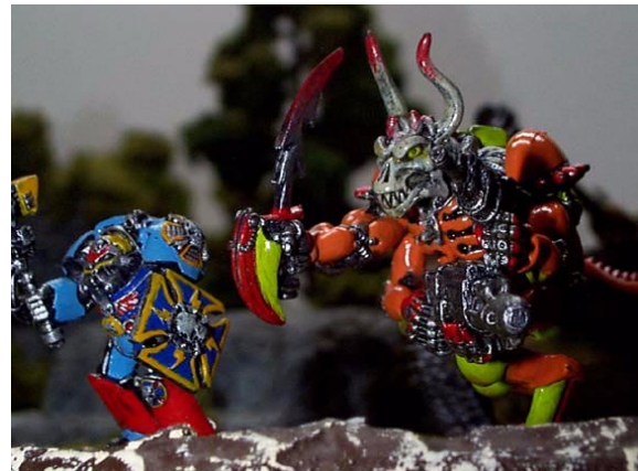
This gives you an idea of the relative size of the Assault Fiend and a trooper in Assault Armor.