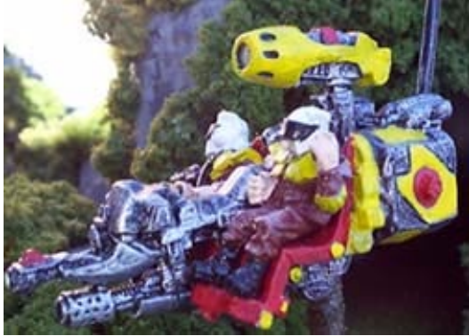
A 2 Seat Low Flyer